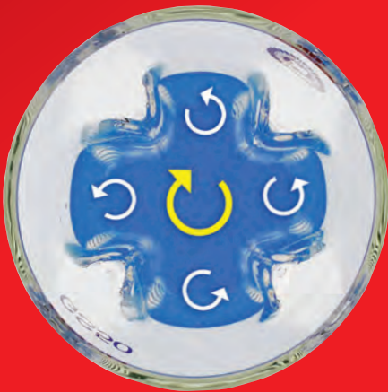
GS vessel principle (viewed from above)

Our GS-glasses are available in chemical- and temperature-resistant borosilicate glass or in stainless steel. Dimensions from a few milliliters to several liters are available, with or without lid, with or without sealed feedthrough.